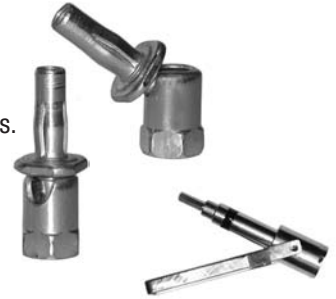
Universal X-Press It® Installation Tool #61200