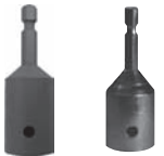
#61192 (Black) #61193 (Red)